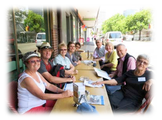
Choir members enjoy lunch on Rock's Walk